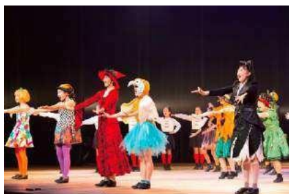
Dances of the Teens Musical SAGA; ICCD 2022 (Feb. 13, 2022)

February 13, 2022 “ICCD 2022 in SAGA” (Virtual); Program in separate sheet. Due to the COVID-19 pandemic, the event was performed virtually.